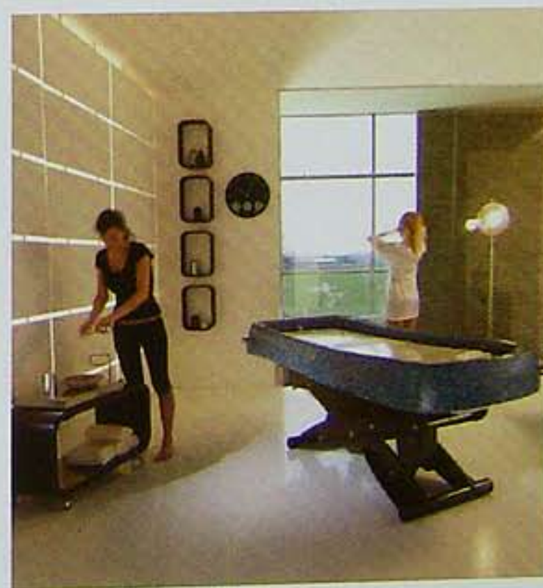
▲ Lemi Group is all about design and functionality