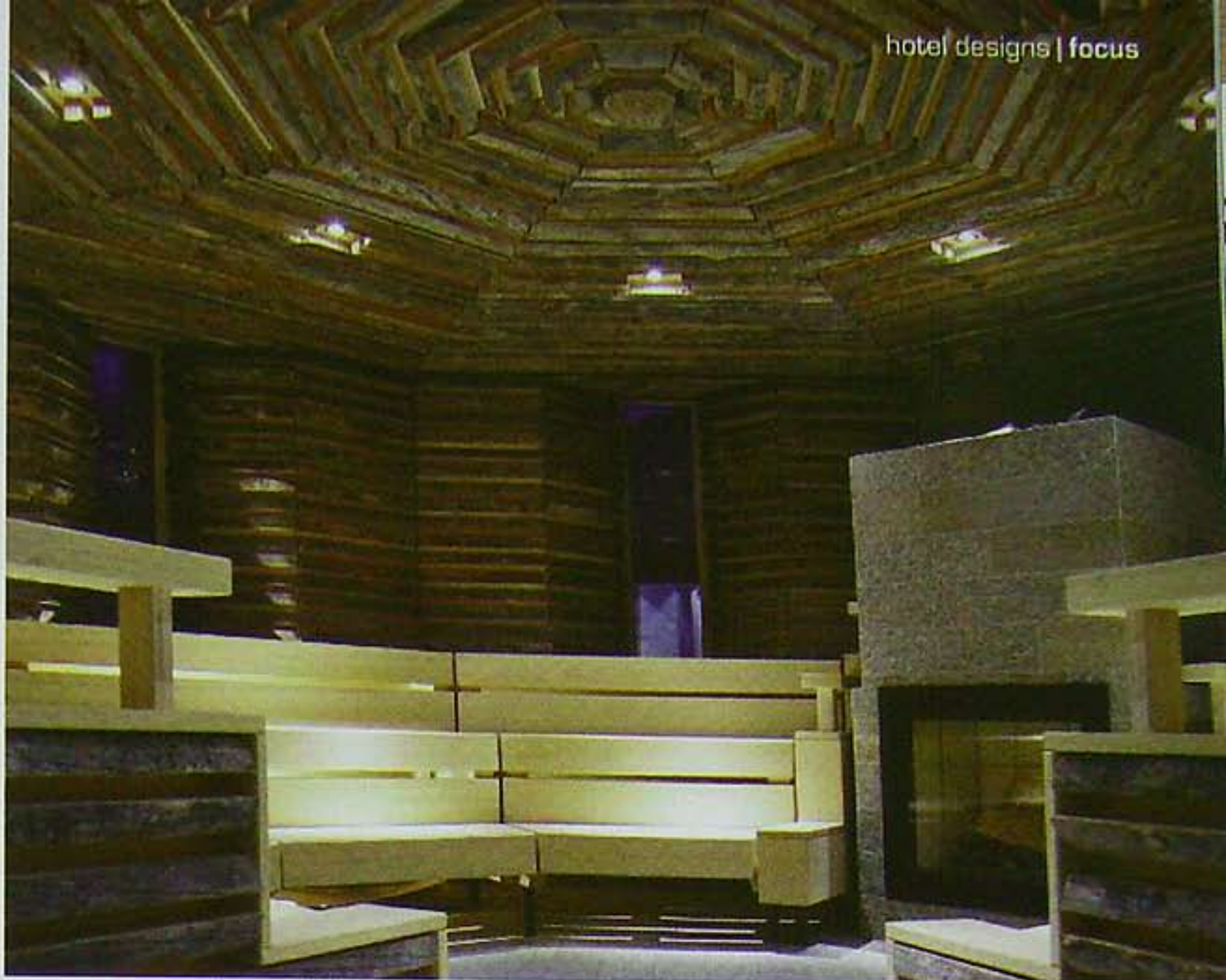
▲ Wonderful wood – Barr and Wray steam room

Barr + Wray is a leading provider of spa and pool engineering solutions and ideas for